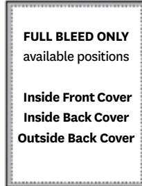
Full Page Non - Bleed