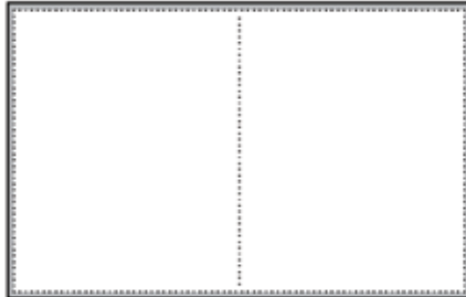
2 - Page Spread Non - Bleed Only